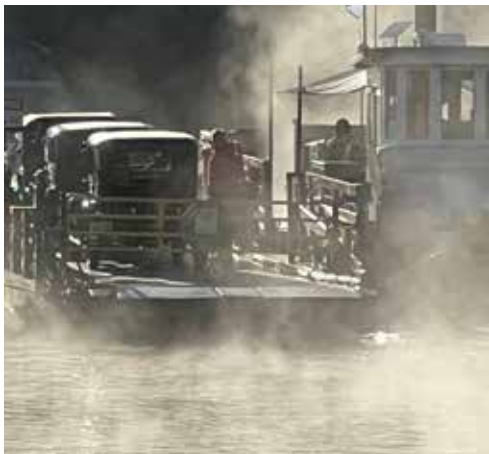
The day began with a foggy crossing of the Kentucky River aboard the Valley View Ferry. On the Madison County side, we were treated to beautiful fall colors along scenic, narrow roads.