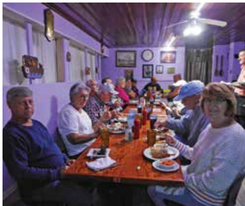
Lunch was at the Lakeview Restaurant in Owenton.