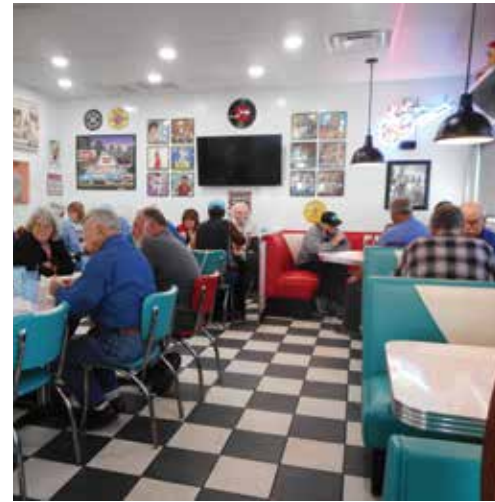
After arriving in Lawrenceburg, we had lunch at a 1950s style diner.

Photos below: The 4-Speed on 50 Museum, adjacent to the diner, featured many beautiful cars of all eras, plus lots of other automotive-related memorabilia. We spent the rest of the afternoon there.