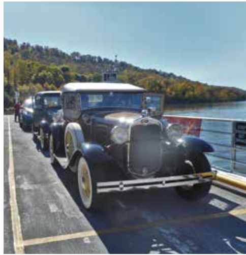
Just up the road from Rabbit Hash was the ferry that carried us across the Ohio River into Indiana.