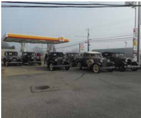
Our departure for home on Sunday morning was delayed a bit due to heavy fog, which had begun to lift by our first gas stop.