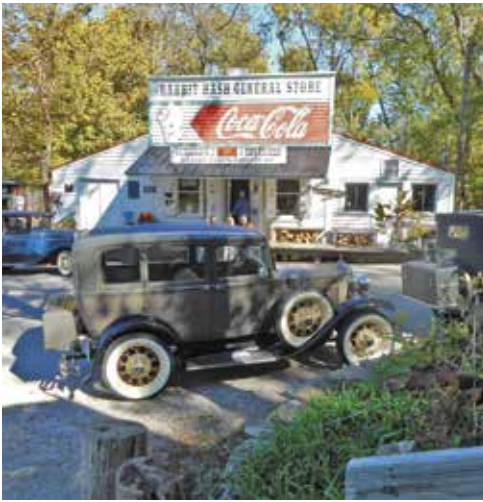
Our first stop on the way to Lawrenceburg was the famous Rabbit Hash General Store.