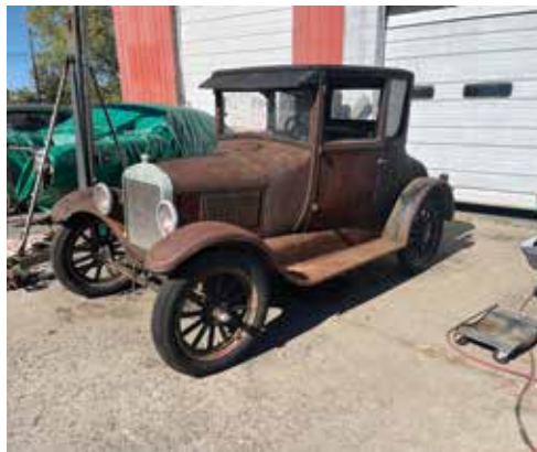
This 1925-27 Ford Model T was parked across the road from our lunch stop.