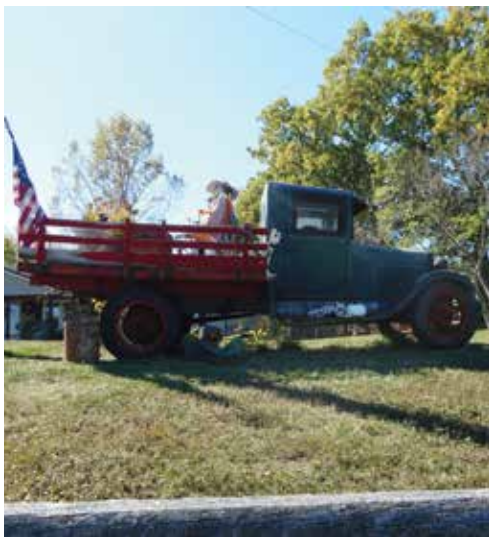
This 1928 Model AA Ford truck was parked in someone's front yard on the road between Owenton and Stamping Ground. It was decorated for Halloween.